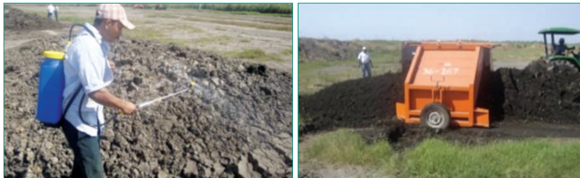
Fig. 8 & 9: Each dose is sprayed on the row before the aerating tractor turns the row to mix, allow gases to escape, and oxygenate the cultures.

After the initial application at the factory, additional applications are made in the field. The first of the field application was performed after 10 days.