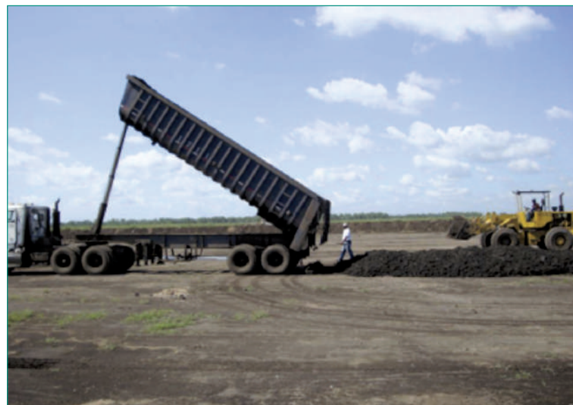
Fig. 2: This picture depicts placement of the windrows.