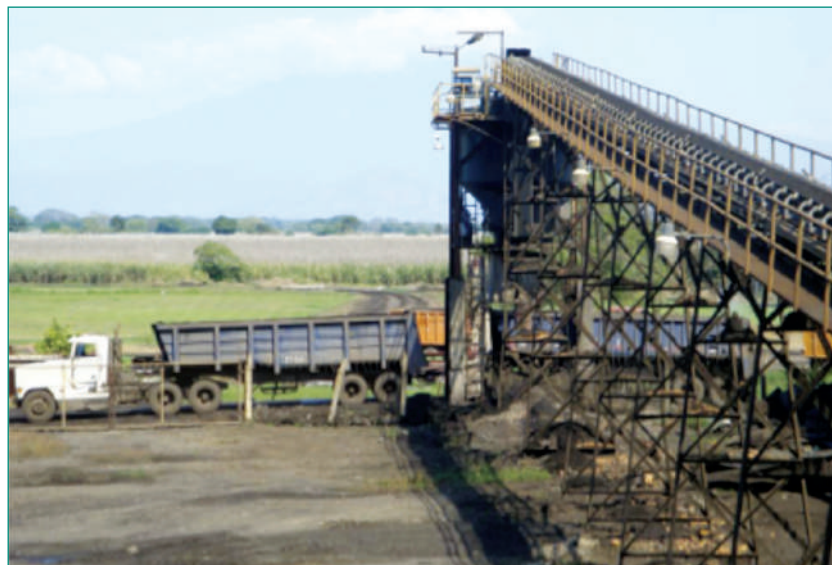
Fig. 1: A large conveyor system was built to handle large volumes of cachaza filling dump trucks which will be used to build windrows.

Magdalena Plantation produces 900 cubic meters of cachaza daily. Using a conveyor system they build 400 meter long windrow rows of cachaza each day and have space for 40 of these rows on site.