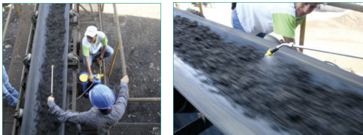
Fig. 3 & 4: The standard procedure of adding moisture to the cachaza before composting offered an ideal opportunity for seeding the cachaza with MICROBE-LIFT®

The plantation's management wanted to increase efficiency of composting in order to reduce labor and increase the capacity of their facility. A field trial was developed to assess the benefits of bioaugmentation with MICROBE-LIFT® core technology that had shown efficacy in numerous other compost applications.