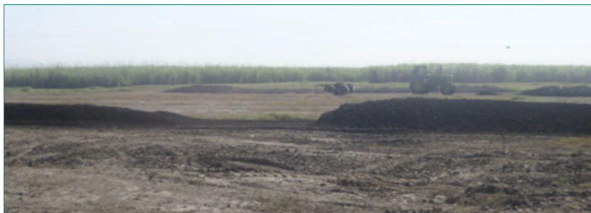
Fig. 10: The difference in the rate of composting is very evident in the treated vs. the control rows by this time validating the increased degradation rate of MICROBE-LIFT® cultures.

The increased degradation of the treated windrow compared to the control is already very evident when the third application was performed 23 days later.