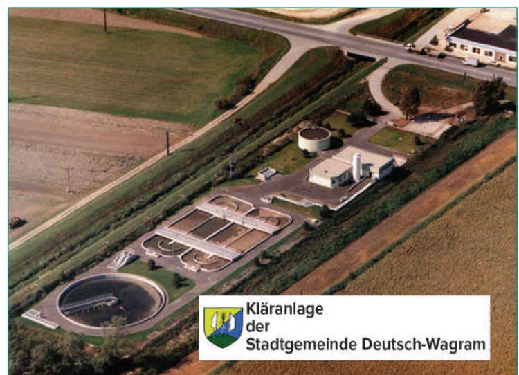
Fig.1: Wastewater Plant at Deutsch-Wagram

A bioaugmentation program was implemented in 1998 for a period of one year to determine if the bioaugmentation program could consistently reduce the amount of sludge generated in the plant. Improving odors and oil and grease breakdown were secondary objectives but were not considered to be enough on their own to justify the cost of product treatment, approximately US $30,000/year.